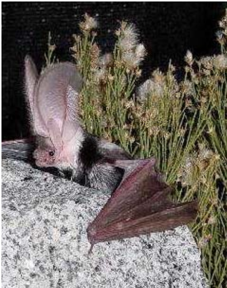
Spotted bat on rock.

Learn why the decline of Bat species and populations worldwide should be a cause for great alarm. Wilkins will describe the different types of bats around the world and here in San Diego. As is our custom, we will have a brief annual meeting and election of our officers for 2005.