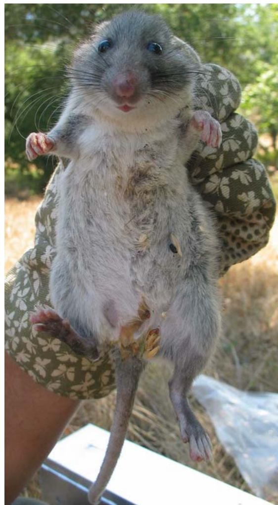
Dusky-footed pack rat ( Neotoma fuscipes ) held by researcher.

In Southern California, the breeding season lasts all year. Gestation period is 33–39 days so dusky-footed woodrats have several litters a year, usually 2–6 in a litter. They have a rather unusual social order too. Recent research has found that when the female gets pregnant, she kicks the male out by biting and scratching his face (Ref. 3). The male then either goes on to cohabit with a different female or builds a new stick house nearby to attract another female. Pack rats have few natural enemies, although coyotes have been known to tear down the stick huts to get at them or their pups. Rattlesnakes also hunt them. Wildfires are their worst natural enemy because their huts are incinerated when the brush fires go through, as happened in the October 2003 firestorms in San Diego. Carmel Mtn. is in its natural state and has never been farmed, plowed, chained, cultivated, or even grazed (cattle won't eat the woody plants).