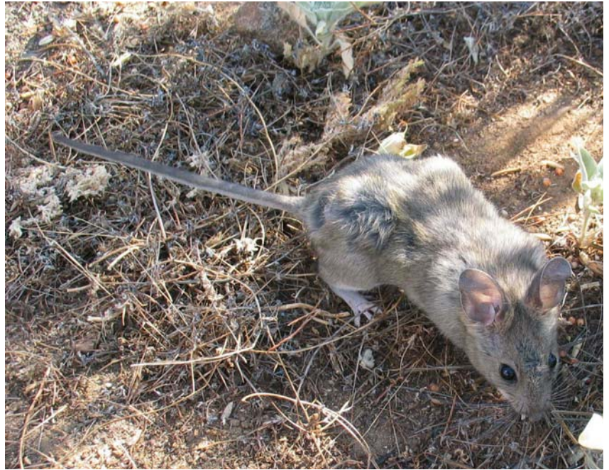
Desert pack rats ( Neotoma lepida ) are also found in Peñasquitos Canyon Preserve. They are often found in close proximity to the dusky-footed pack rat where their habitat types overlap.