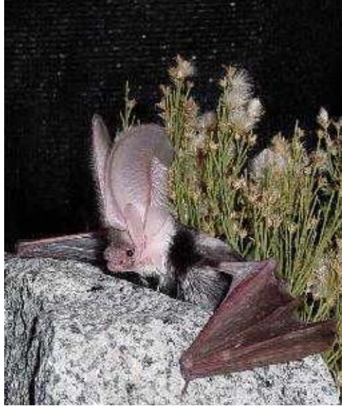
Spotted bat on rock.