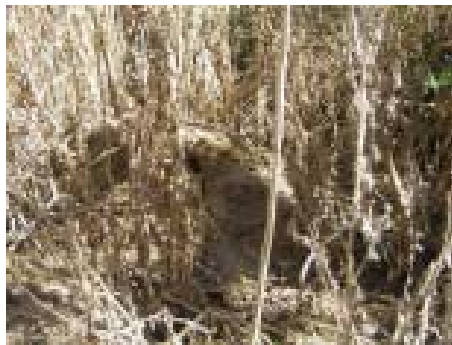
Weeds obscure Bovet adobe ruin.

The pueblo land of Soledad valley was initially meant to be used by the