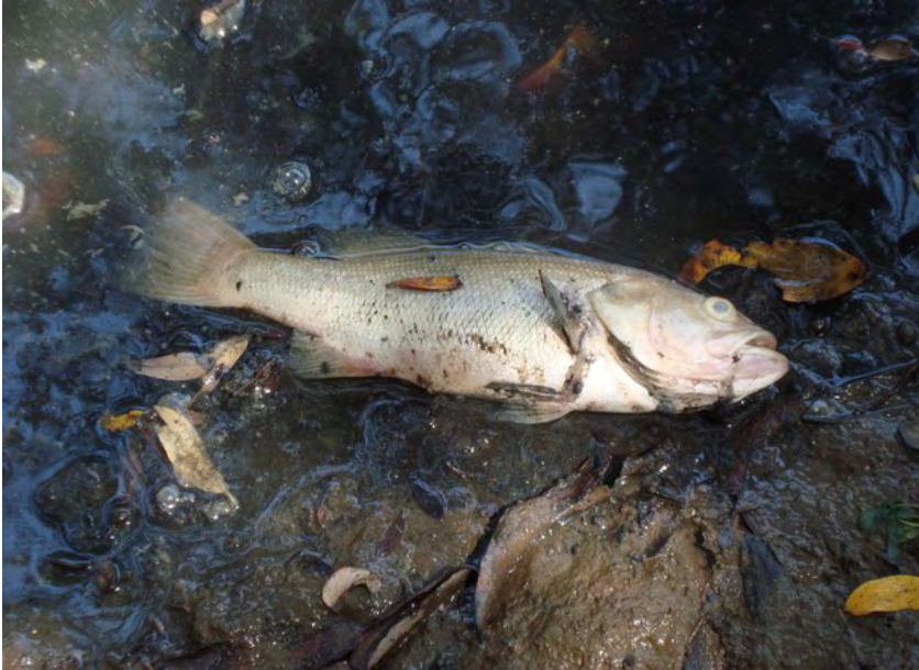
Above: A dead fish found at the Los Peñasquitos Lagoon is a casualty of the sewage spill that occurred following the San Diego County-wide blackout.

I was hiking with my sisters in the White Mountains of New Hampshire when the call came. It was Union-Tribune Reporter Mike Lee calling to get my reaction to the spillage of raw sewage into Peñasquitos Lagoon. I had to ask “what sewage spill?” I hadn’t been following San Diego news while on vacation and didn’t know about it. But, as Yogi Bear put it, it was “deja vu all over again,” because the old Pump Station 64 was the source of many spills in the 1980s and 1990s. The relatively new Pump Station 64 was suppose to end this sorry record of spills.