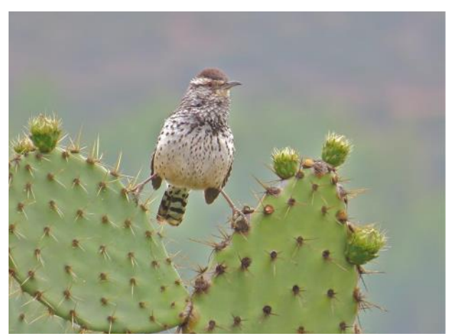
Female Coastal Cactus Wren, Bernardo Mountain 2014.