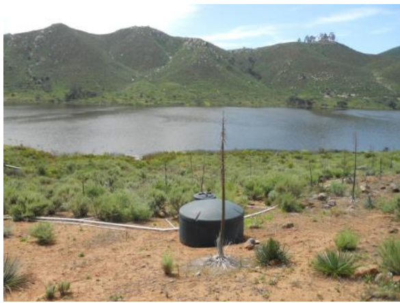
SDRP restoration site March 2011