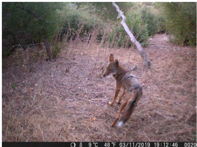
Younger Coyote caught on critter cam in Peñasquitos Canyon Preserve.