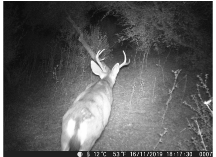
Health looking Mule deer buck, 6 or 8 point, caught on critter cam in Peñasquitos Canyon Preserve, 11/16/19.

Visit our website at www.penasquitos.org for a wealth of pictures, archived newsletters, videos, links and more.