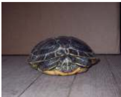
Red-eared slider turtle , a non-native turtle often dumped in the Preserve.

Years ago a live-in volunteer was weed-whipping by the Ranch House, and came upon a most unusual rock . . . well, it moved. The volunteer brought the "rock" to Ranger Paul's desk. After checking our reptiles and amphibians field guides, it was determined to be an exotic critter. After a couple of hours living in Ranger Paul's desk drawer, the San Diego Turtle and Tortoise Society rescued it.