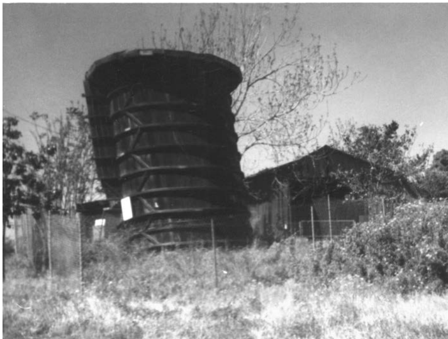
Figure 2 - The old red barn and silo as they looked in 2005. Both the silo and barn have since fallen down.

The Clews family then tried to acquire the now empty Mt. Carmel Ranch from the City of San Diego. After some initial discussion with the City, they offered to exchange