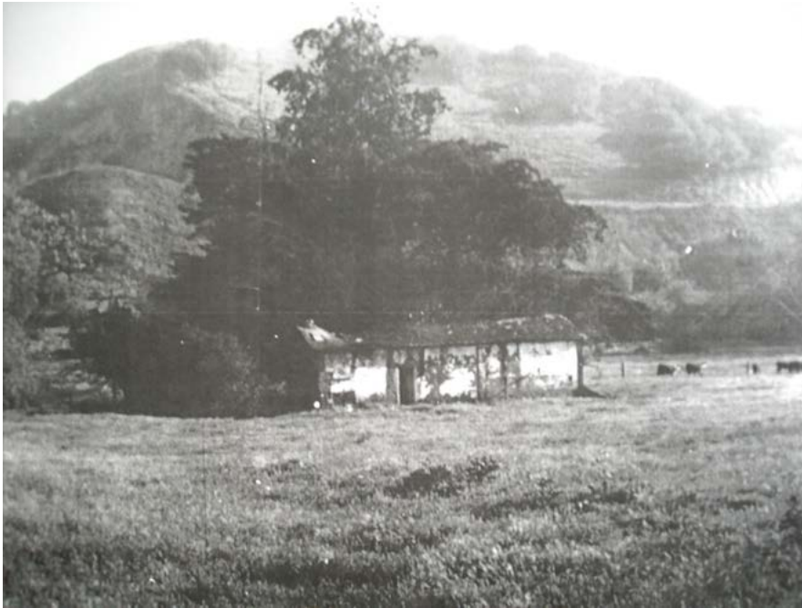
1958 Photograph of the Bovet adobe.

[Will Bowen compares a newly discovered picture of the Bovet Adobe (above) with pictures used to accompany his article in our previous Canyon News (Jul/Aug/Sep 2008). Please refer to this issue or visit our website, www.penasquitos.org , to make this comparison. - Editor]