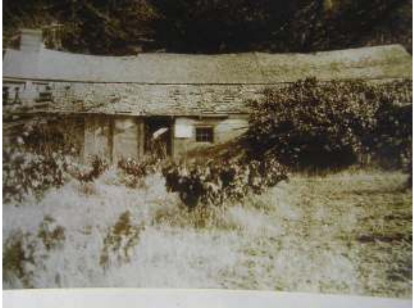
Nell Lester's painting of the Bovet.

The Bovet adobe has been the subject of at least two paintings in the style of the Plein Aire