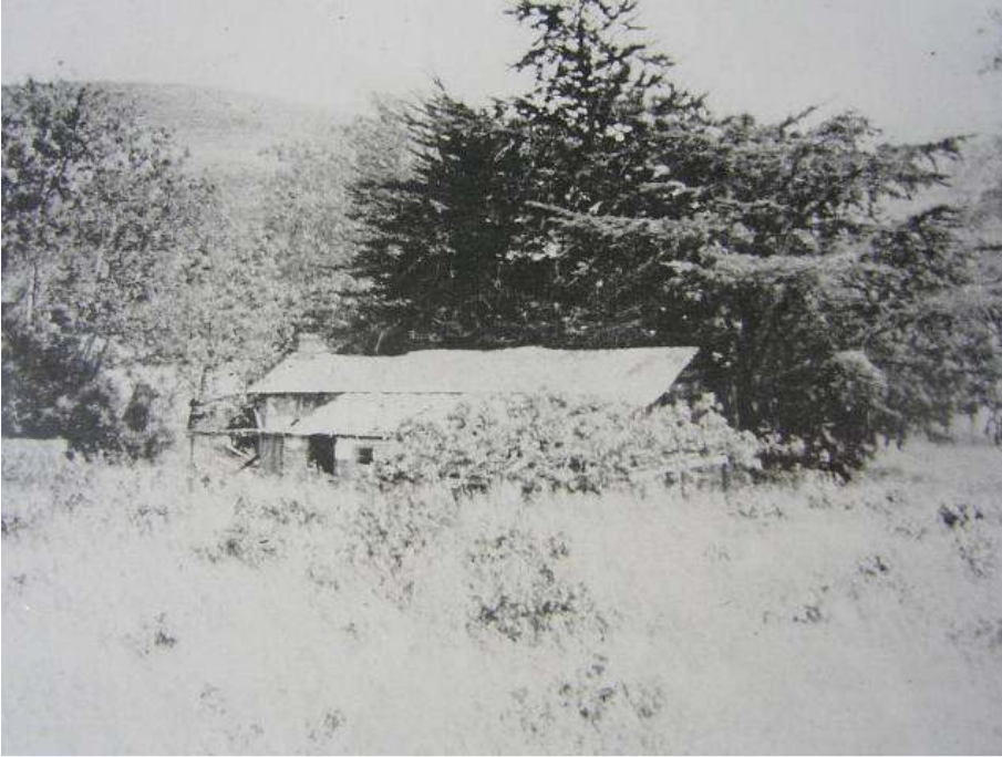
Bovet adobe in a dilapidated condition with only 1/2 the roof — notice the close cropped grass from the presence of cattle and a wall with a passage knocked thru it.

which mislabeled the ruins as “The López Adobe.” But if you knew something about the history of the place and the people who lived there and their relationship to other of the historic peoples of old San Diego, then you might be able to see more. The past might come alive again and your imagination would allow you to understand the true significance of this place.