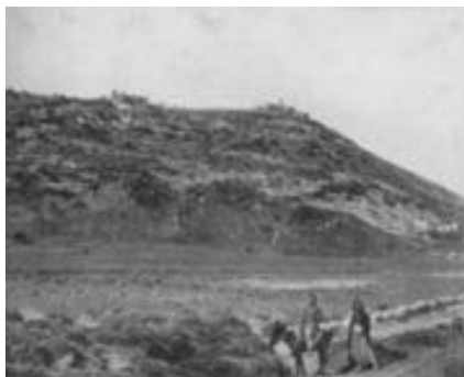
Mount Carmel - Circa 1894.