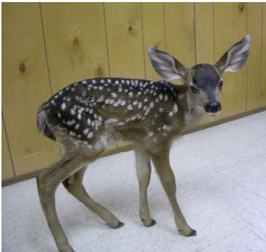
One-week old fawn found wandering near the El Cuervo Mitigation site, now at the Rancho San Diego rehabilitation center in Jamul.

I was able to arrange with the Project Wildlife volunteer to meet her in Rancho San Diego to take the fawn to her rehabilitation center in Jamul. So I put the little guy in a box with a towel next to me in my truck, after about a minute, he settled down and slept the whole way there. So far, the fawn is doing really well and we are planning to release him back in Los Peñasquitos Canyon when he is old enough. I think this experience was the highlight of my Park Ranger career.