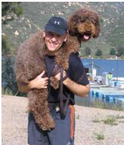
Labradoodle "Murphy" and companion, ??

from a distance since, everyday for the past two and one-half years; I carry Murphy on my back when he starts to get tired. He generally walks and runs for the first 5-7 miles of the day then, usually at the onset of a big uphill climb; he sits down and waits for me to pick him up. From there, I usually carry him between 3 to 5 miles a day. So far, Murphy has logged more than 3,800 miles on my back, much to his delight.