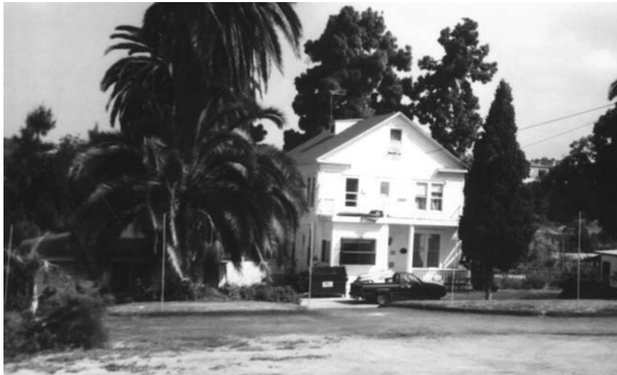
Figure 1 - The “Big House” built by the Sisters of Mercy in 1906. It’s now a Jewish synagogue called Chabad Del Mar.