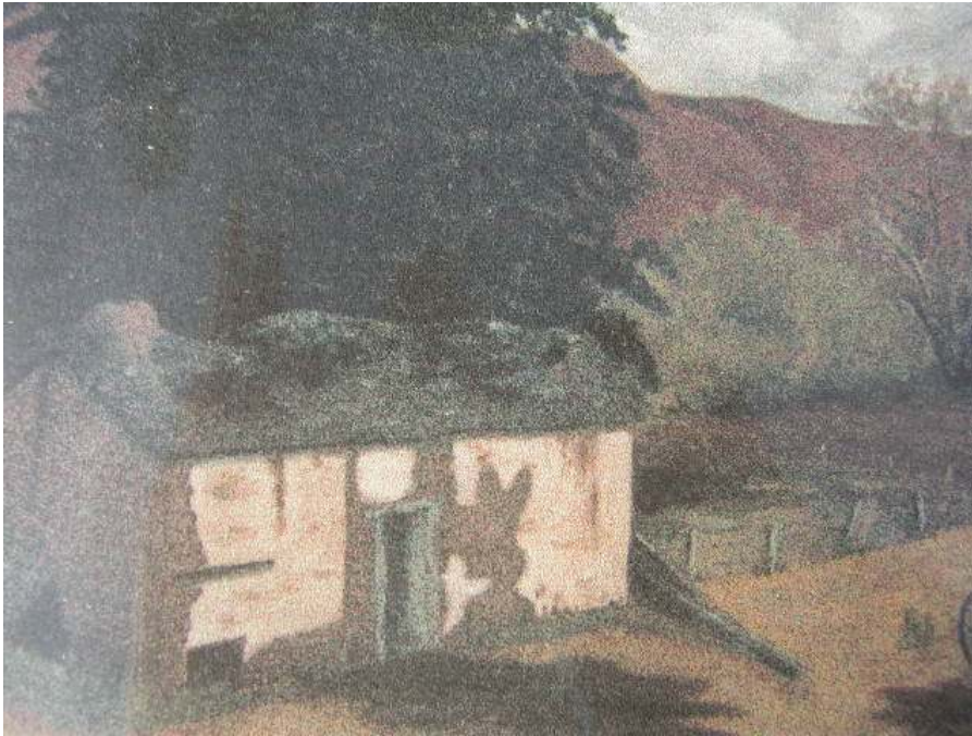
Back view of Bovet Adobe from a distance.

"When I was a child, I used to pass through Old San Diego and see its ruined adobe houses. I often wondered who had lived in them, what kind of life the people had, and what had become of them. Some of the houses were still standing, some were minus great patches of plaster and the adobe was showing through, and many had melted back into the earth of which they were made. Their inhabitants were gone . . . What had happened to them? . . . Of what avail had been their lives?"