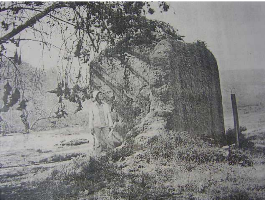
Side view of Bovet — you can see wood planking and part of the front porch.

If you were to go down to the ruins of the Bovet Adobe today you might not think there was much left to see — just a 2-3 foot high mound of melted adobe bricks, some adobe flooring, and three dried up old dead cypress trees, one of which has fallen. You would also see two metal poles near the edge of the adobe which once held a plaque, now long lost,