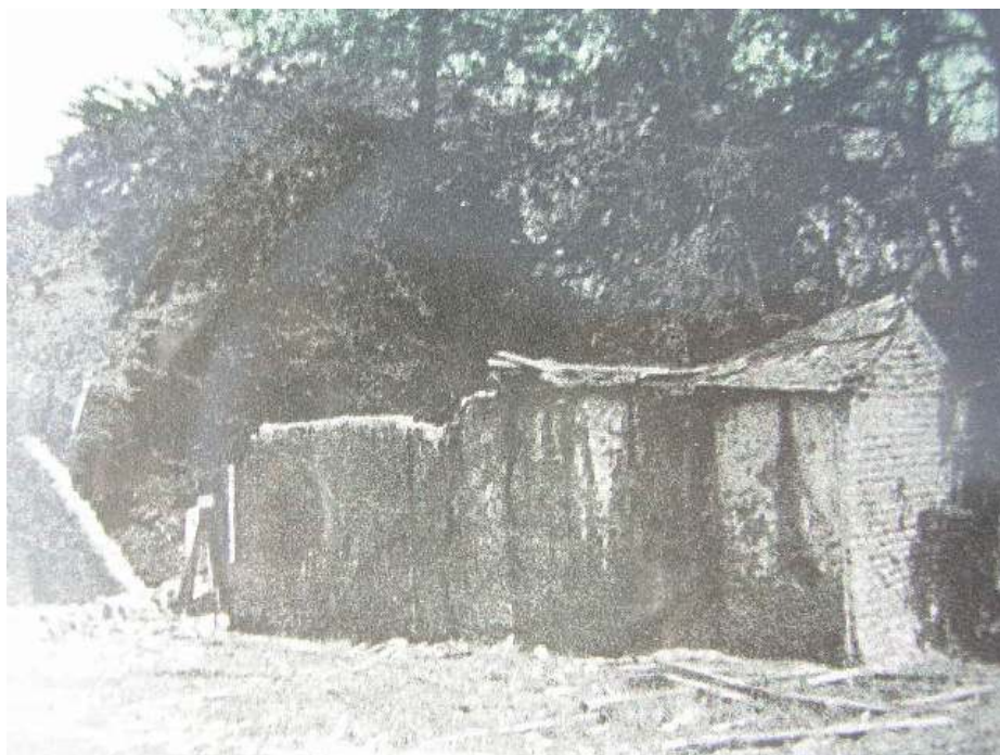
Back view of Bovet from close up.