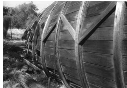
Figure 3 - The silo after it fell down in 2006. The barn fell down

their 90 acres on the north rim of Peñasquitos Canyon Preserve for the 40 acres (actually 38.44 acres behind the "Big House" (City of San Diego 2006). In addition, they offered to donate 20 acres to the City of San Diego for inclusion in the City's Multiple Species Conservation Plan (MSCP) and only use 20 acres for their horse ranch.