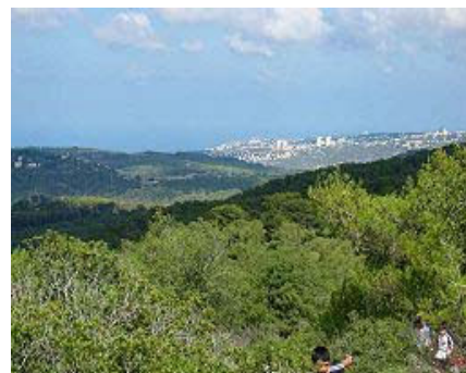
Mount Carmel - today.

As the circa 1894 photo shows, Mount Carmel in Israel does indeed resemble the northern end of Carmel Mountain. The vegetation also appears similar to our chaparral in form and shape, although not to genus and species, since both that site and San Diego share a Mediterranean climate.